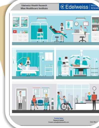
Max Healthcare Company Report