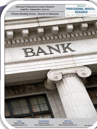
Private Banking Sector Report