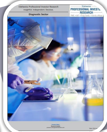
Diagnostics Sector Report