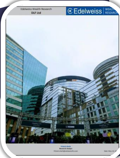
DLF Company Report