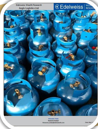
Aegis Logistics Company Report